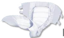
Briefs (Adult Diapers)

Provides comfort and dignity, with a secure trim fit for moderate to heavy bladder and/or bowel protection .