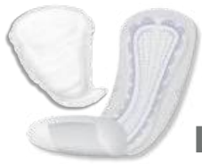
Liners & Pads

Ideal for light to heavy bladder leakage protection , liners are designed to be easily worn with regular underwear .